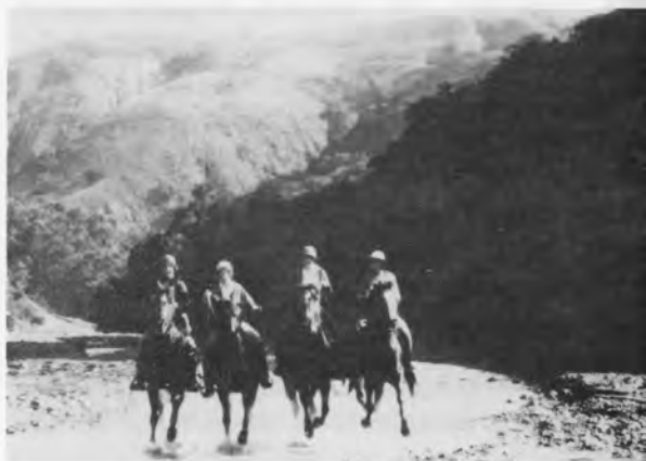
Right: The creekbed road up the Cañada del Puerto on Santa Cruz.